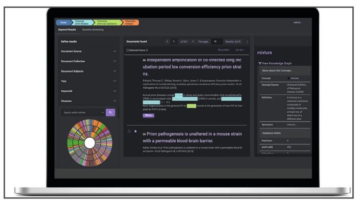
Comfortable user experience with AILANI